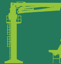
SEPARATE PLACING BOOMS